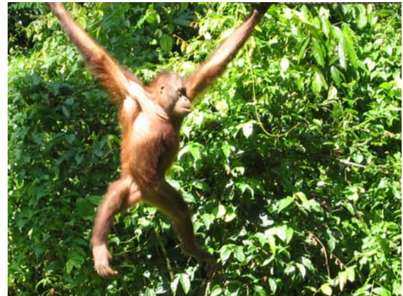
Sepilok Rehabilitation Centre