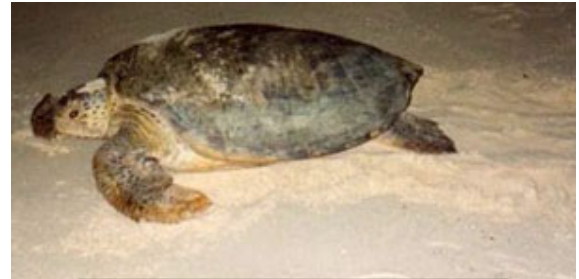
Turtle at Selingan Island

Exclude: Flight tickets Kota Kinabalu/Sandakan/Kota Kinabalu, camera entrance fees other not mentioned above